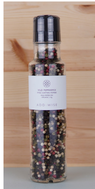
FOUR KINDS OF PEPPER 125G ART E11219 PACK SIZE 9PCS EAN 7350090693853