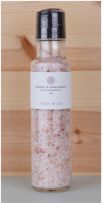
HIMALAYASALT & SEA SALT 300G ART E11044 PACK SIZE 9PCS EAN 7350090693846