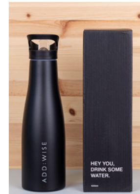
THERMOS 630ML WITH STRAW ART E11295 PACK SIZE 1PCS RETAIL SEK 250 / €30