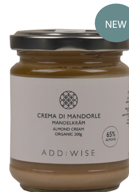
ALMOND CREAM 200G ITALY ART E11137 PACK SIZE 4PCS EAN 7350090699640