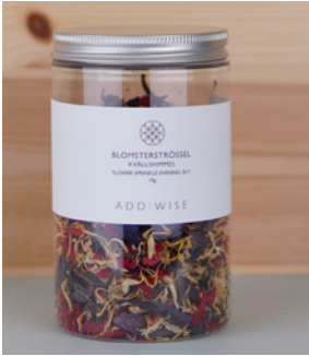
EVENING SKY 15G ART E11029 PACK SIZE 9PCS EAN 7350090699305