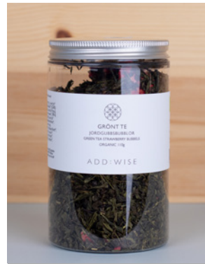
GREEN TEA STRAW- BERRY BUBBLES 110G ART E11100 PACK SIZE 9PCS EAN 7350090693167