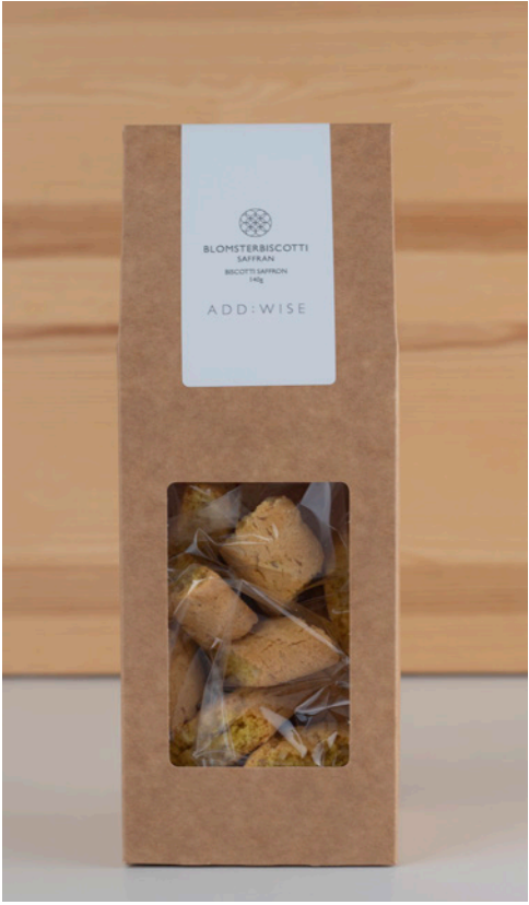
BISCOTTI SAFFRON FROM SWEDEN ART E11150 PACK SIZE 8PCS EAN 7350090693075