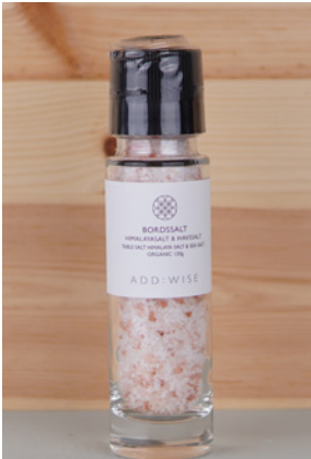
HIMALAYASALT & SEA SALT 120G ART E11063 PACK SIZE 6PCS EAN 7350090693952