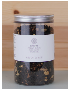
MAGIC CHAI TEA 125G ART E11101 PACK SIZE 9PCS EAN 7350090699060