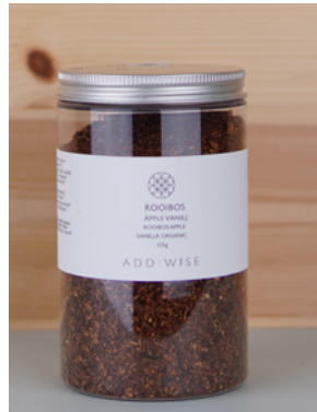
ROOIBOS TEA APPLE & VANILLA 125G ART E11105 PACK SIZE 9PCS EAN 7350090692771