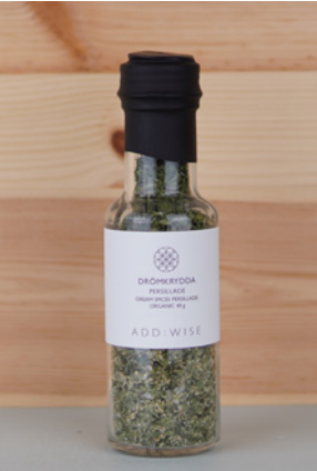
PARSLEY 40G ART E11020 PACK SIZE 6PCS EAN 7350090692924