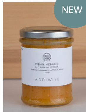
HONEY SAFFRON FROM SWEDEN 250G ART E11140 PACK SIZE 4PCS EAN 7350090699701