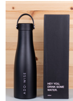
THERMOS 630ML ART E11294 PACK SIZE 1PCS RETAIL SEK 250 / €30