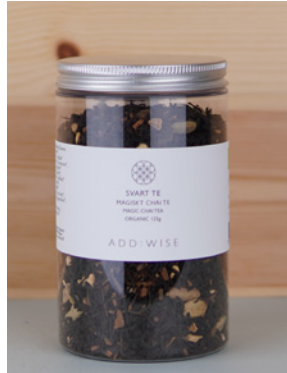
MAGIC CHAI TEA 125G ART E11101 PACK SIZE 9PCS EAN 7350090699060