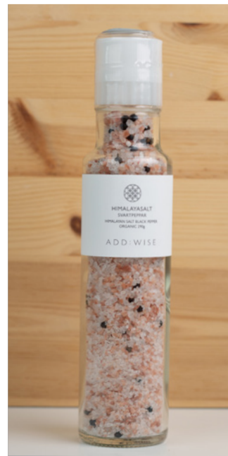
HIMALAYA SALT & BLACK PEPPER 290G ART E11053 PACK SIZE 9PCS EAN 7350090692184