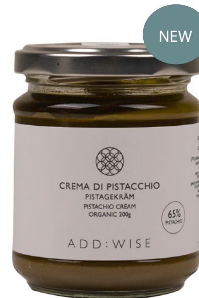
PISTACHIO CREAM 200G ITALY ART E11136 PACK SIZE 4PCS EAN7350090699633