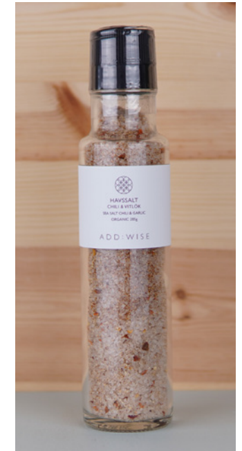
SEA SALT CHILI & GARLIC 285G ART E11045 PACK SIZE 9PCS EAN 7350090693822