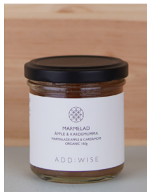
MARMALADE APPLE & CARDAMOM SWE 160G ART E11132 PACK SIZE 9PCS EAN 7350090699466