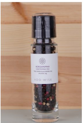
BLACKPEPPER MIX 60G ART E11062 PACK SIZE 6PCS EAN 7350090693945