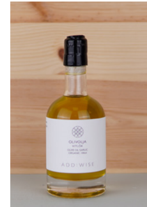
GARLIC 100ML ART E11201 PACK SIZE 9PCS EAN7350090693648