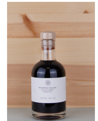
BALSAMIC VINEGAR RASPBERRY 200ML ART E11261 PACK SIZE 9PCS EAN 7350090691057