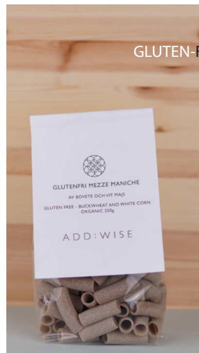
PASTA MEZZE MANICHE 250G GLUTEN-FREE ITALY ART E11243 PACK SIZE 12PCS EAN 7350090690227