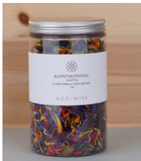
HAPPY BIRTHDAY 35G ART E11032 PACK SIZE 9PCS EAN 7350090699480