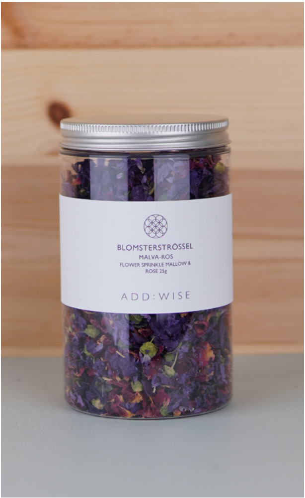
MALLOW ROSE 25G ART E11034 PACK SIZE 9PCS EAN 7350090690241