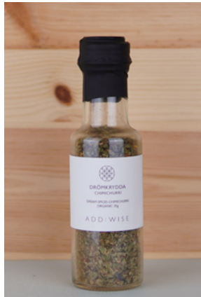
CHIMICHURRI 35G ART E11022 PACK SIZE 6PCS EAN 7350090692955