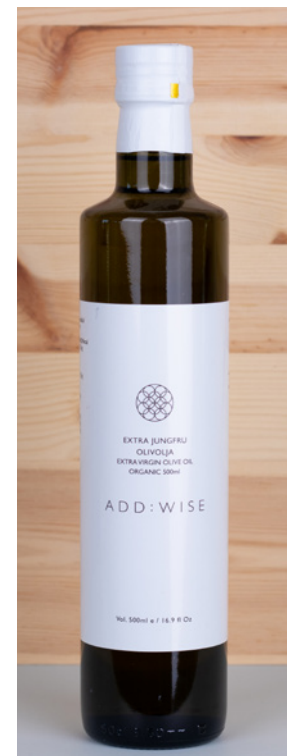
EXTRA VIRGIN OLIVE OIL 500ML ART E11002 PACK SIZE 9PCS EAN 5200323613139