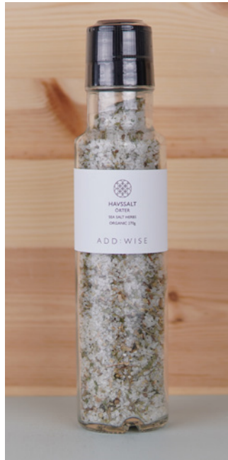
SEA SALT HERBS 270G ART E11046 PACK SIZE 9PCS EAN 7350090692191