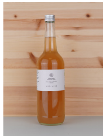
LEMONADE RHUBARB VANILLA 700ML ART E11126 PACK SIZE 12PCS EAN 7350090692344