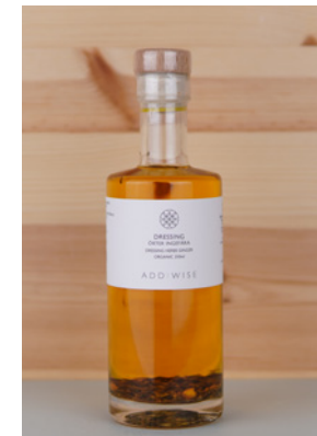
DRESSING HERBS GINGER 250ML ART E11005 PACK SIZE 9PCS EAN 7350090692733