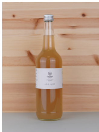
LEMONADE LEMON 700ML ART E11124 PACK SIZE 12PCS EAN 7350090692320