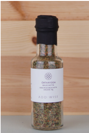
BRUSCHETTA 40G ART E11014 PACK SIZE 6PCS EAN 7350090699282