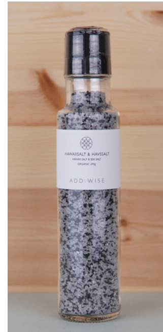
HAWAIIISALT & SEA SALT 290G ART E11043 PACK SIZE 9PCS EAN 7350090693839