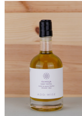
BLACK TRUFFLE 100ML ART E11199 PACK SIZE 9PCS EAN 7350090693624