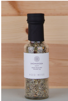
MEAT 80G ART E11013 PACK SIZE 6PCS EAN 7350090699084