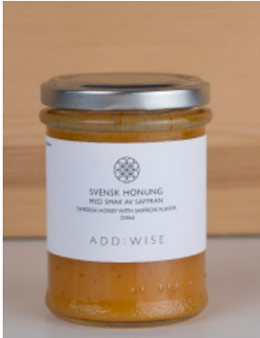
HONEY SAFFRON FROM SWEDEN 250G ART E11140 PACK SIZE 4PCS EAN 7350090699701