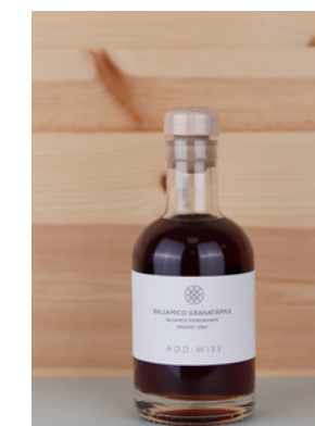
BALSAMIC VINEGAR POMMEGRANAT 200ML ART E11260 PACK SIZE 9PCS EAN 7350090691040