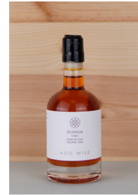
CHILI 100ML ART E11203 PACK SIZE 9PCS EAN 7350090693662