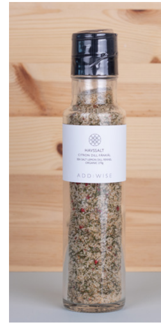
SEA SALT LEMON DILL FENNEL 270G ART E11039 PACK SIZE 9PCS EAN 7350090692573