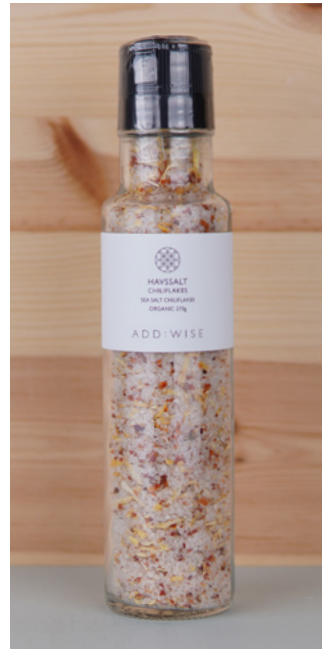
SEA SALT CHILIFLAKES 280G ART E11047 PACK SIZE 9PCS EAN 7350090692207