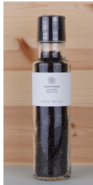
BLACK PEPPER 145G ART E11218 PACK SIZE 9PCS EAN 7350090693815