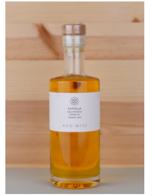
SWE RAPESEED OIL COLD PRESSED 250ML ART E11000 PACK SIZE 9PCS EAN 7350090693280