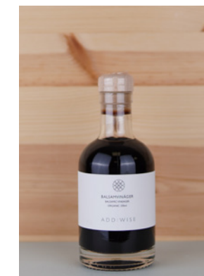
BALSAMIC VINEGAR 200ML ART E11003 PACK SIZE 9PCS EAN 7350090691491