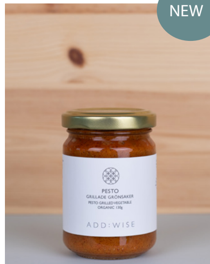
PESTO GRILLED VEGETABLES 130G ITALY ART E11134 PACK SIZE 6PCS EAN7350090693006