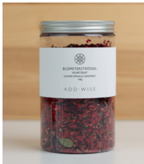
HEARTBEAT 100G ART E11033 PACK SIZE 9PCS EAN 7350090691644