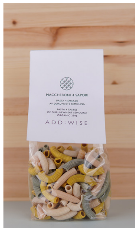
PASTA MACCHERON 4 SAPORI 250G ITALY ART E11240 PACK SIZE 12PCS EAN 7350090690197