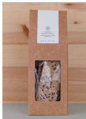
CRISPBREAD SEA SALT & LINSEED SWE 100G ART E11143 PACK SIZE 8PCS EAN 7350090699183