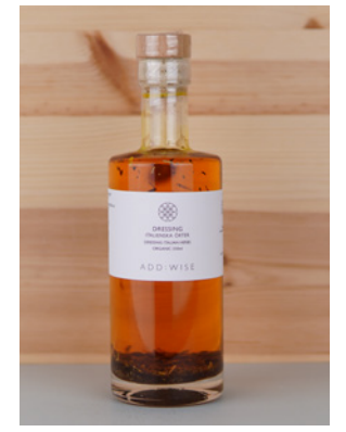
DRESSING ITALIAN HERBS 250ML ART E11008 PACK SIZE 9PCS EAN 7350090699176