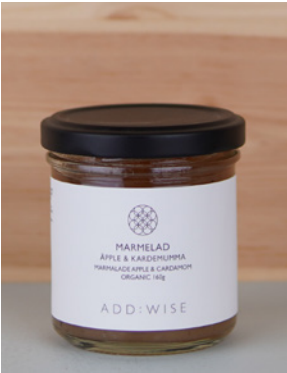
MARMALADE APPLE & CARDAMOM SWE 160G ART E11132 PACK SIZE 9PCS EAN 7350090699466