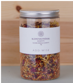
CONFETTI 30G ART E11031 PACK SIZE 9PCS EAN 7350090692610