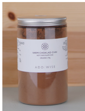
HOT CHOCOLATE CHAI 270G ART E11127 PACK SIZE 9PCS EAN 7350090693181