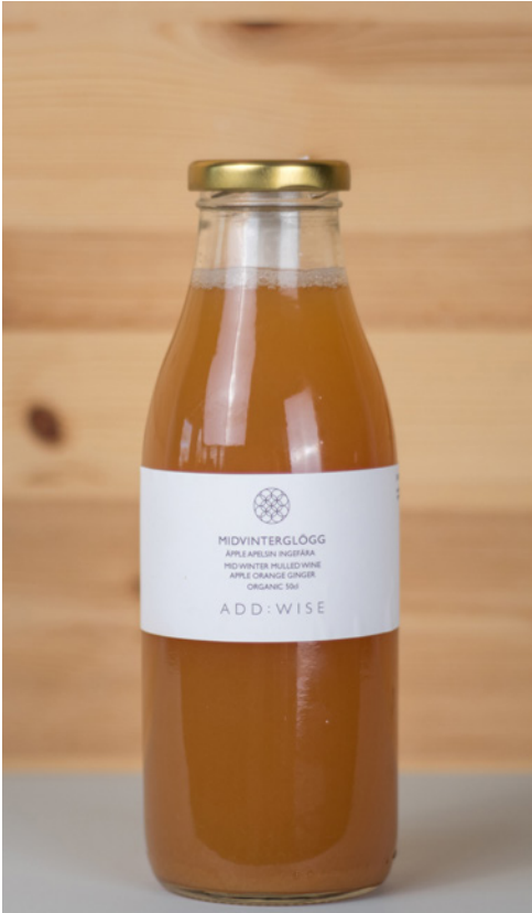
MULLED WINE APPLE ORANGE GINGER SWE 50CL ART E11195 PACK SIZE 6PCS EAN 7350090693372