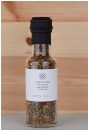
HOT HERBS 60G ART E11015 PACK SIZE 6PCS EAN 7350090699299