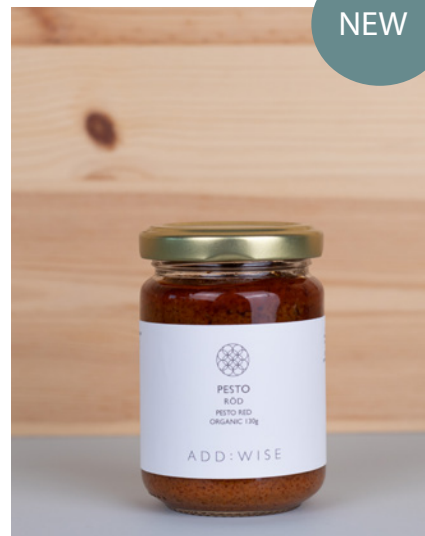
PESTO RED 130G ITALY ART E11135 PACK SIZE 6PCS EAN 7350090693013