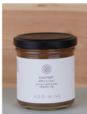
CHUTNEY APPLE & CHILI SWE 160G ART E11133 PACK SIZE 9PCS EAN 7350090699473