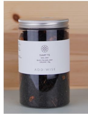
TEA EARL GREY BLACK 100G ART E11106 PACK SIZE 9PCS EAN 7350090690661