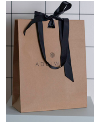
GIFT BAG ART E11296 PACK SIZE 1PCS