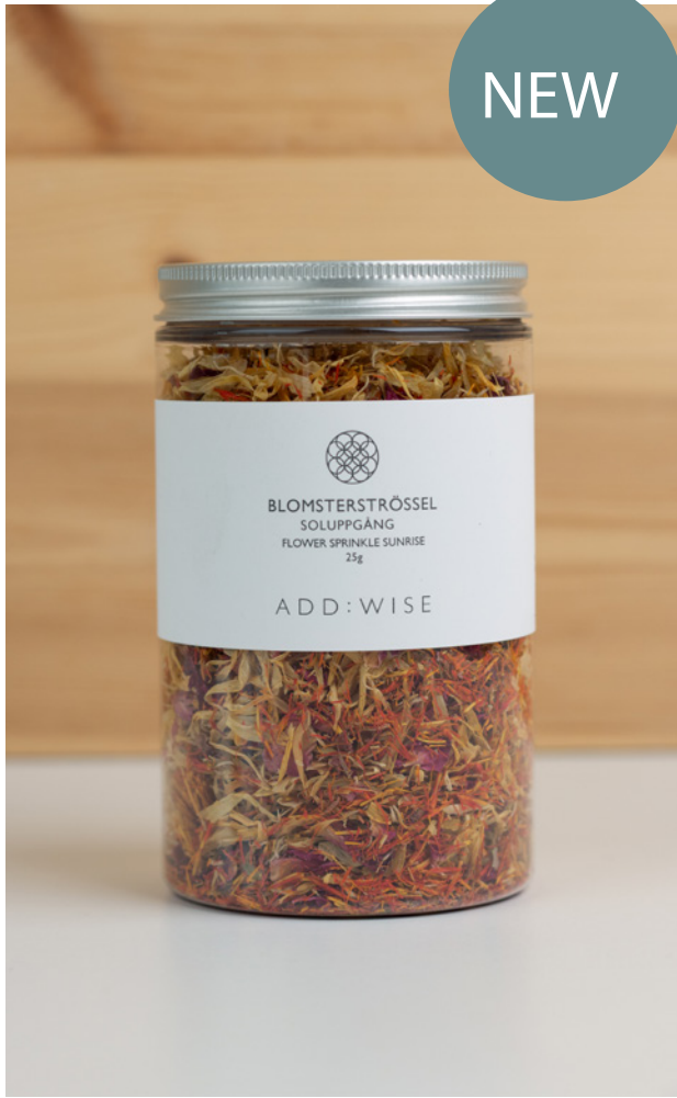
SUNRISHE 25G ART E11036 PACK SIZE 9PCS EAN 7350090699695