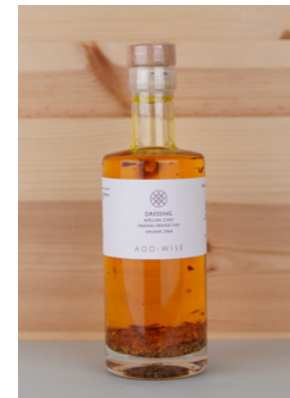
DRESSING ORANGE CHILI 250ML ART E11006 PACK SIZE 9PCS EAN 7350090692740