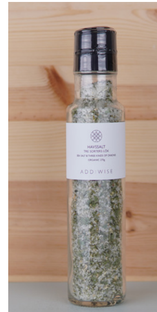
SEA SALT & THREE KINDS OF ONIONS 270G ART E11038 PACK SIZE 9PCS EAN 7350090699121