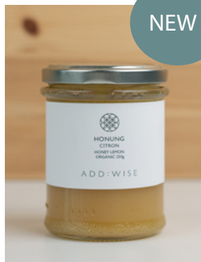
HONEY CITRUS FROM SWEDEN 250G ART E11139 PACK SIZE 4PCS EAN 730090699664