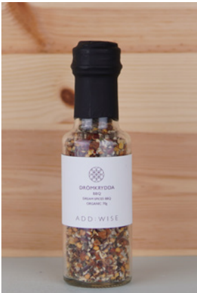
BBQ RUB 80G ART E11012 PACK SIZE 6PCS EAN 7350090690845