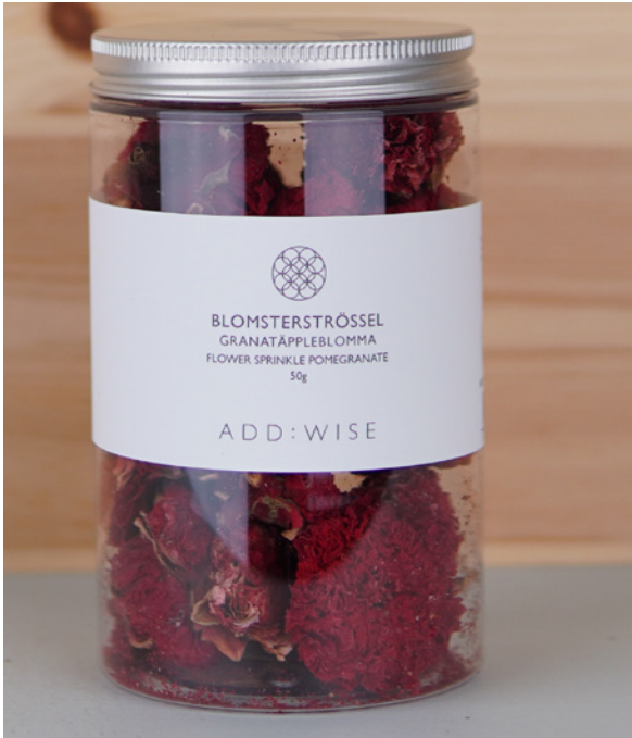
POMEGRANATE 30G ART E11027 PACK SIZE 9PCS EAN 7350090699220