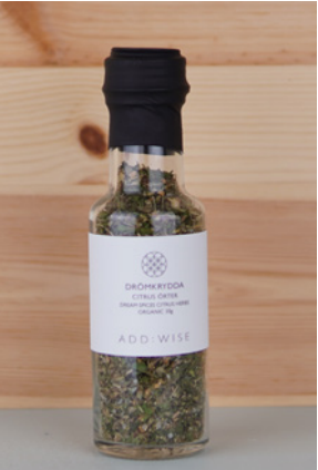
CITRUS HERBS 30G ART E11018 PACK SIZE 6PCS EAN 7350090692764