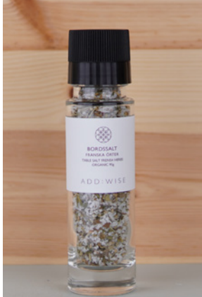
SEASALT FRENCH HERBS 95G ART E11065 PACK SIZE 6PCS EAN 7350090699503