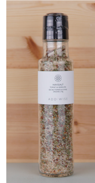
TOMATO & CHIVES 270G ART E11040 PACK SIZE 9PCS EAN 7350090699329