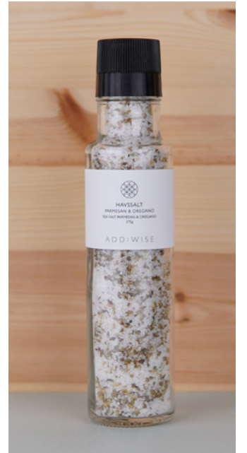
SEA SALT PARMESAN & OREGANO 285G ART E11041 PACK SIZE 9PCS EAN7350090699510