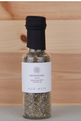
PESTO 50G ART E11023 PACK SIZE 6PCS EAN 7350090692962