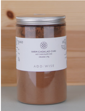
HOT CHOCOLATE CHAI 270G ART E11127 PACK SIZE 9PCS EAN 7350090693181